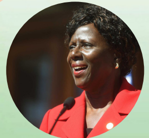
State Senator Pat Miller